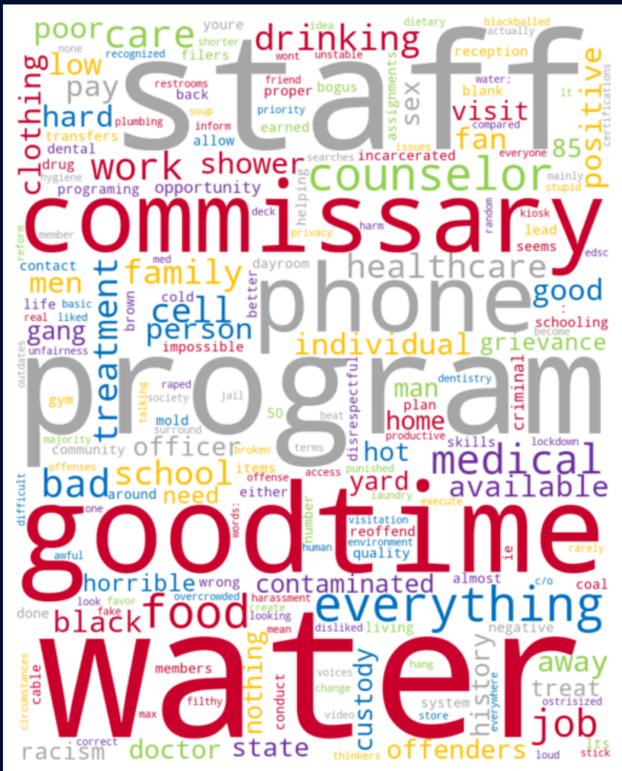
Word cloud generated using the most common words used in Vienna survey responses to the question "What are the most negative things about life in this prison?"